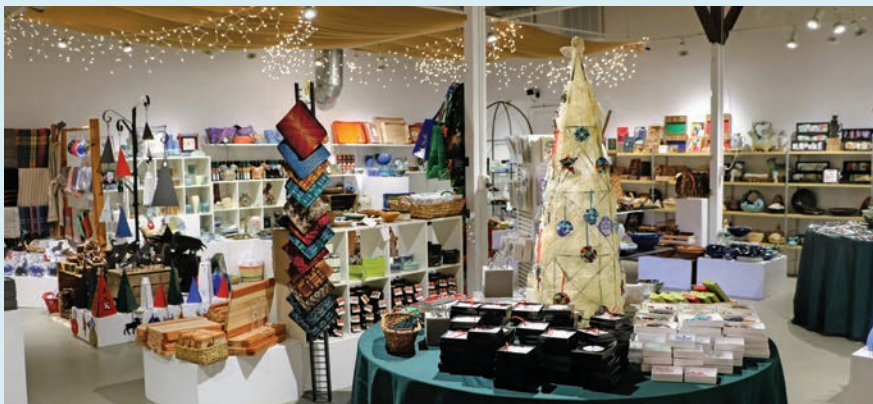
FIND UNIQUE GIFTS AT ARTISTRY