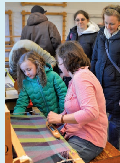
JOIN US FOR OPEN ARTS DAY