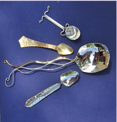
Making Spoons [workshop]: Sue Sachs

Student's clay must be purchased in class ($29 or $32/bag); tool kits ($14 + tax) also available. Please bring cash or check. Lab and clay fees cover costs of firings and glaze materials. Tuition includes bench time.