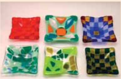
Introduction To Fused Glass [workshop] with Christa Lorusso