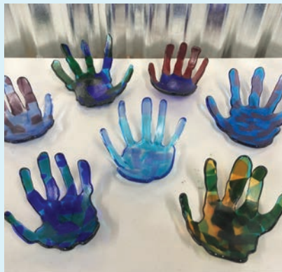
Glass Fusion Student Work

After 12/3: Tuition $213.00 Members $191.70