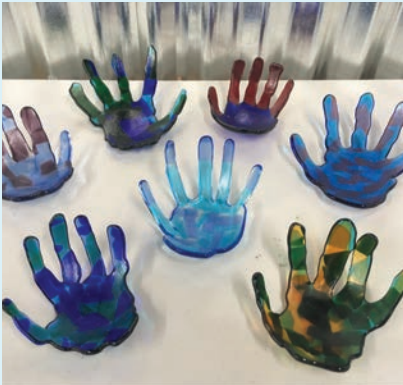
Glass Fusion Student Work

Through 12/3: Tuition $200.00 Members $180.00 After 12/3: Tuition $213.00 Members $191.70