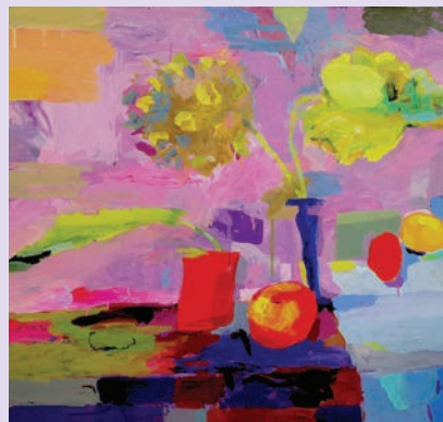
Lexa McCrady Axon

After 12/3: Tuition $264.00 Members $237.60