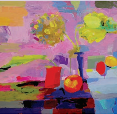
Lexa McCrady Axon

After 12/3: Tuition $264.00 Members $237.60