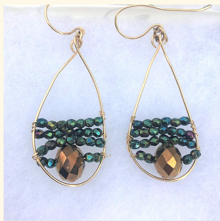
Beaded Wire Frame Earrings Workshop with Lynn Sheft