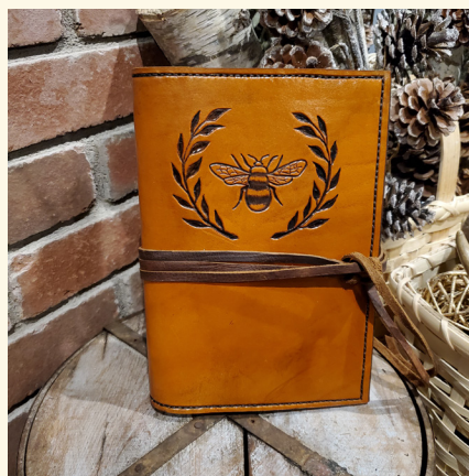
Refillable Leather Journal Cover Workshop with Katie Coleman