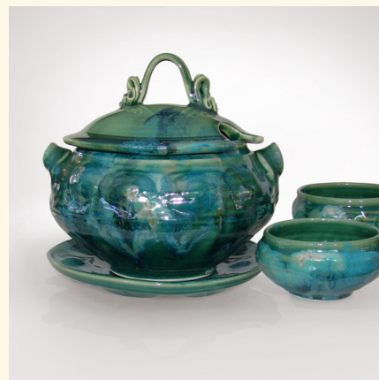
From Form to Function with Deborah Staub Luft