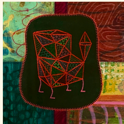
Encaustic Printmaking without a Press Workshop with Leslie Giuliani