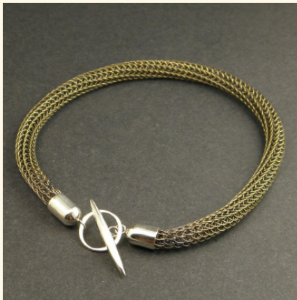
Low Tech Wire Chains Workshop with Joy Raskin