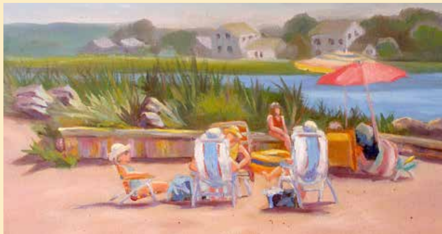
Sign up for painting classes with Patricia Meglio.