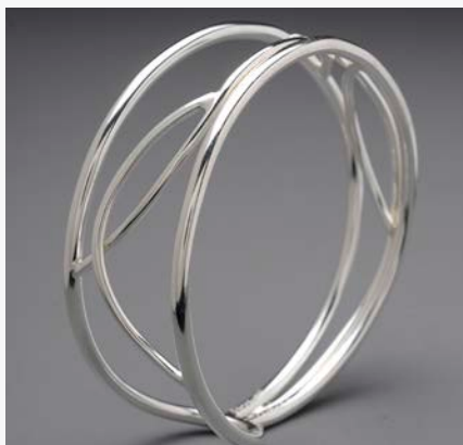
Bangles & Rings Workshop with Joy Raskin