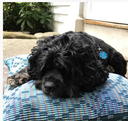
Floor Loom Weaving with Linda Edwards