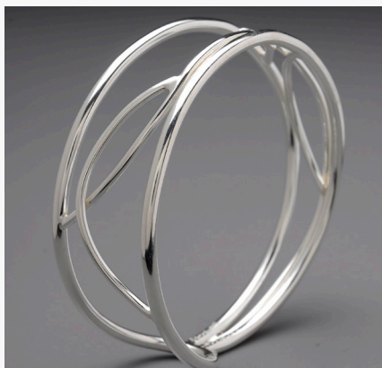
Bangles & Rings Workshop with Joy Raskin