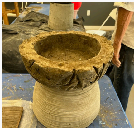
The Art of Hypertufa Workshop with Lyn Magill