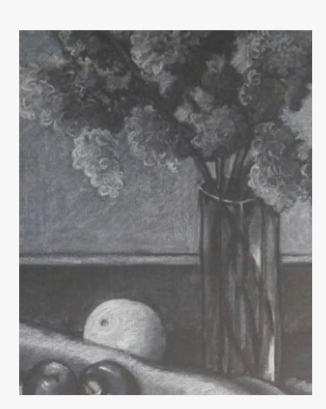
Beginning Drawing Workshop with Dolores Marchese