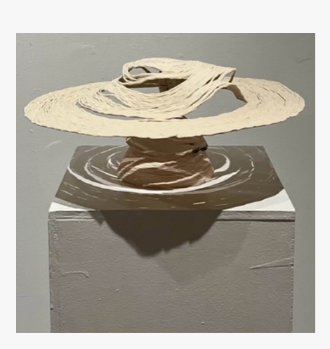
Ceramic Sculpture with Lisa Wolkow