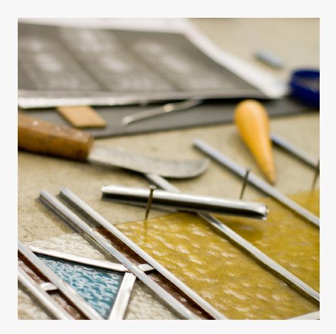
Stained Glass with Eileen O'Donnell