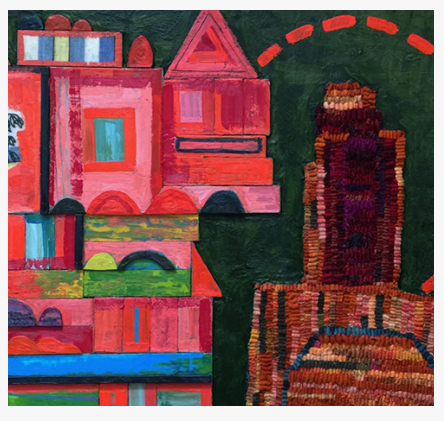
Mixed Media & Encaustic Workshop with Leslie Giuliani