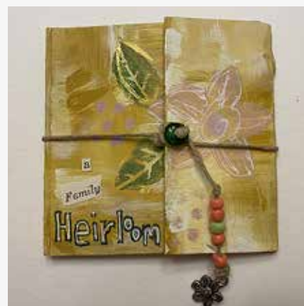
Mini Memoir Collage Book Workshop with Janice Baker