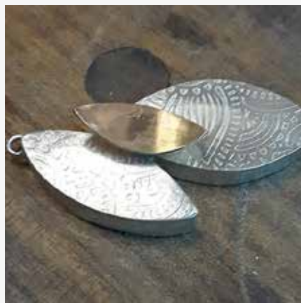
Box Clasps Workshop with Joy Raskin