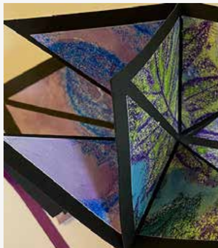
Stained Glass Inspired Mini Book Workshop with Janice Baker (See page 3)