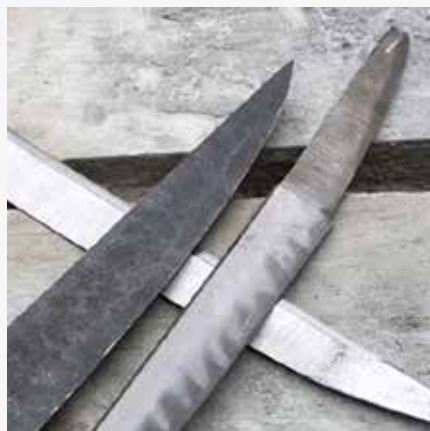
The Art of the Japanese Blade Workshop with Mace Vitale (See page 3)