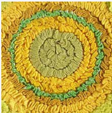
Shirret Crochet Workshop with Lexa McCrady