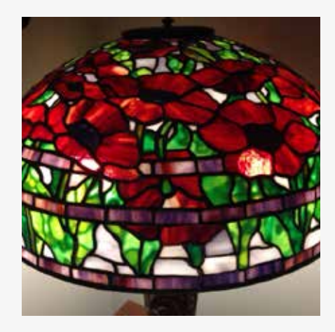
Stained Glass with Fileen O'Donnell