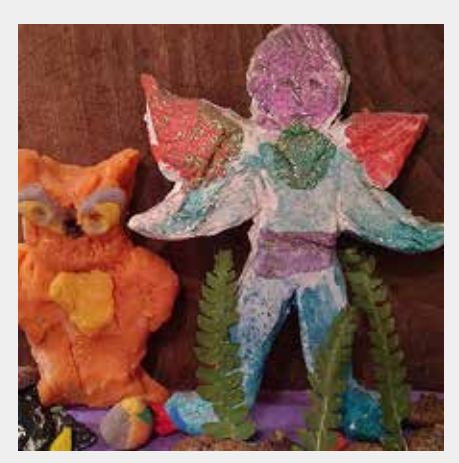
Winter Clay Wonderland with Carole Firth