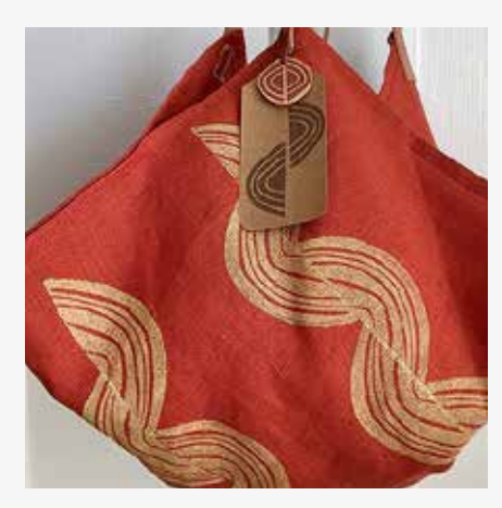
Sew A Four Corner Tote Bag Workshop with Claudia Mathison