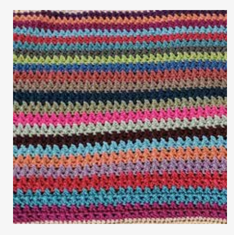
Beginning Crochet Workshop with Netra Garani