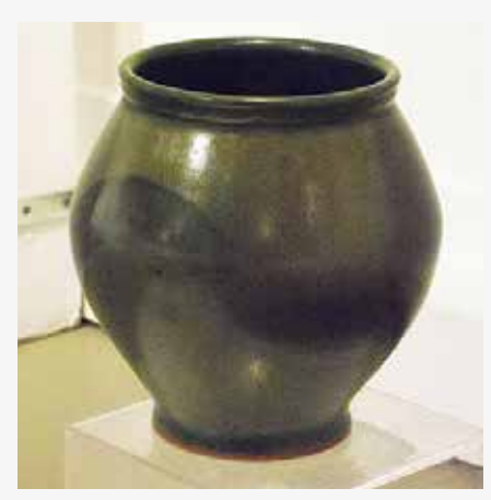
Creating With Clay with Alice Chittenden