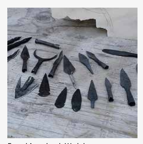
Forged Arrowheads Workshop with Mace Vitale