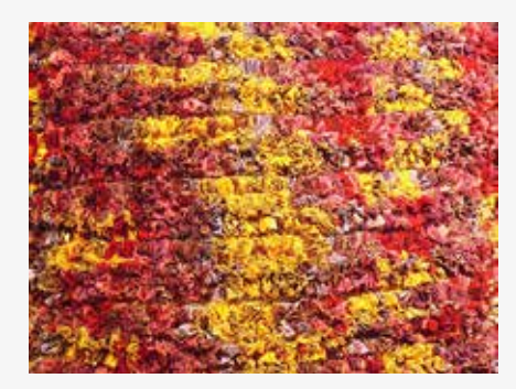
Floor Loom Weaving with Linda Edwards