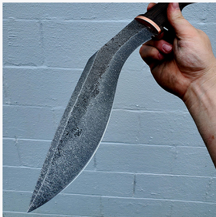
Forging Khukuri Knives Workshop with Aidan Garrity