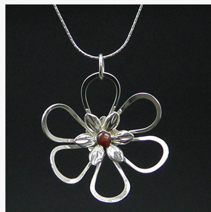
Flower & Leaf Pendants Workshop with Joy Raskin