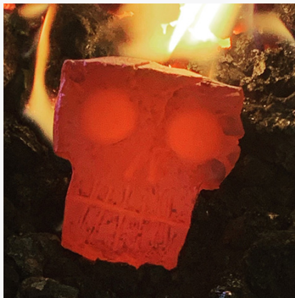
Forging Skulls & Faces Workshop with Mace Vitale