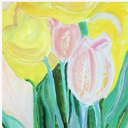
Watercolor Painting With The Masters Online: A Focus On Composition with Marcy LaBella