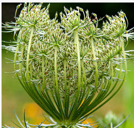
Basics Of Digital Photography Workshop with Bruce Dunbar