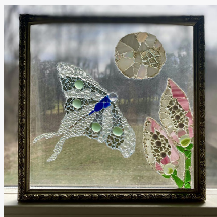
Glass Mosaic Window Workshop with Janice Baker