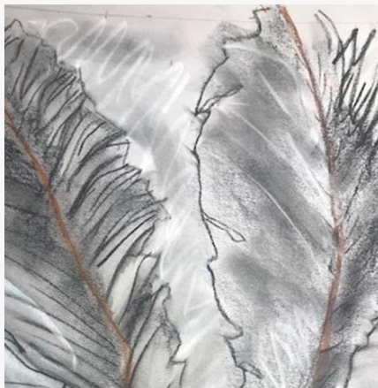
Charcoal Drawing Workshop with Lisa Arnold