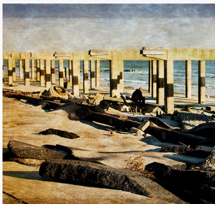
Introduction To Digital Photography with Melanie Stengel