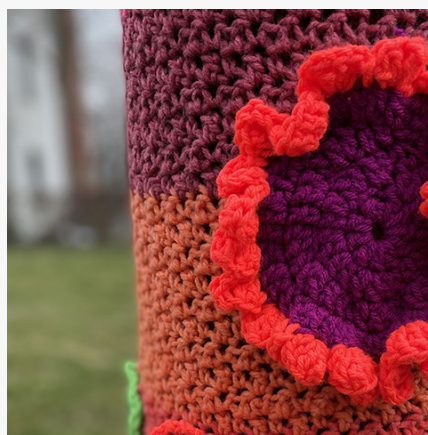
Yarn Bombing 101 with Marsha Borden