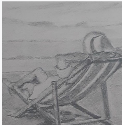
Drawing The Four Seasons with Patricia Meglio