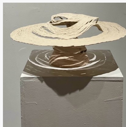
Ceramic Sculpture with Lisa Wolkow