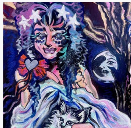
BYOB Paint & Sip Workshop: Fantasy Worlds and Characters with Dove Hellman