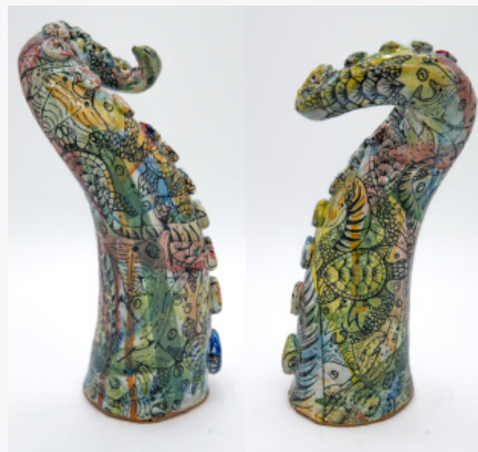
Tentacle Techniques: Sculpting Workshop with Casey Potts