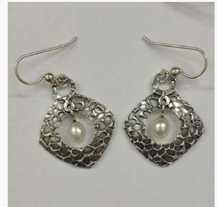
Discover Silver Metal Clay Workshop with Nancy Karpel