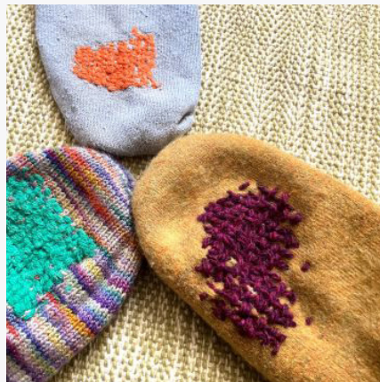
Visible Weave Darning Workshop with Lena Meyerson