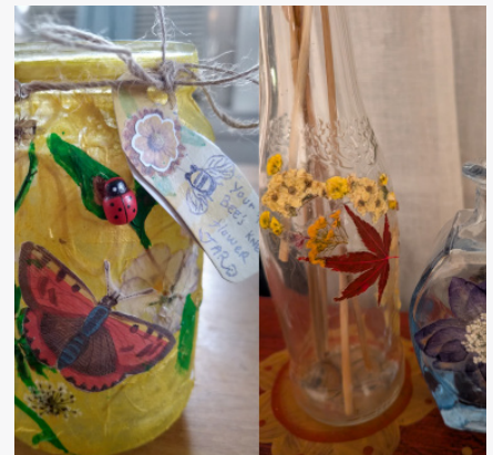
Botanical Designs on Glass Forms with Carole Firth