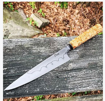
Hand-Forged Kitchen Knife Workshop with Mace Vitale