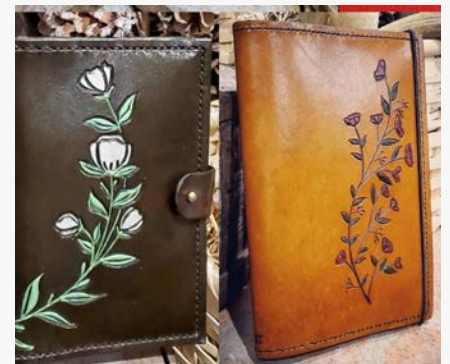
Refillable Journal/Book Cover Workshop with Katie Coleman