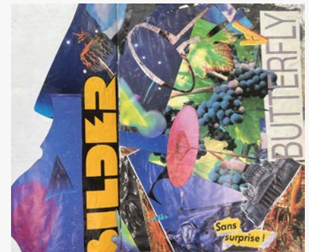
Experimental Collage Workshop with Anne Benkovitz