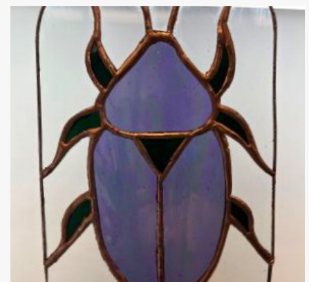
Stained Glass with Eileen O'Donnell