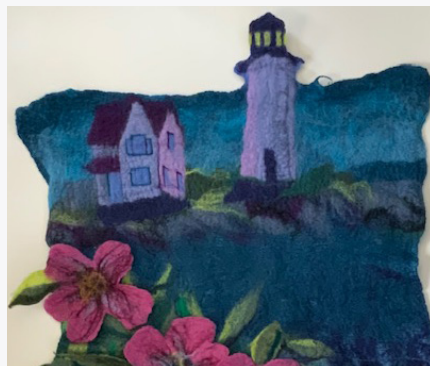
Felted Tapestry Workshop with Robin McCahill