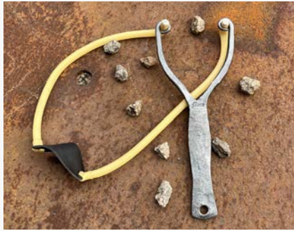
Slingshots! Forging A Slingshot Workshop with Mace Vitale