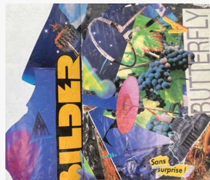
Experimental Collage Workshop with Anne Benkovitz