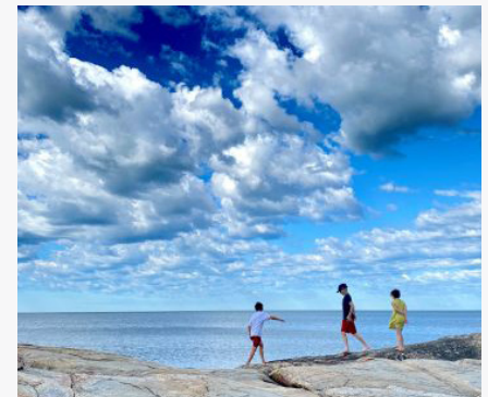
Smartphone Photography: Tips and Tricks with Briget Ganske