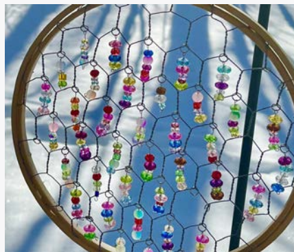
Create a Sparkling Crystal Suncatcher Workshop with Peggy Esposito