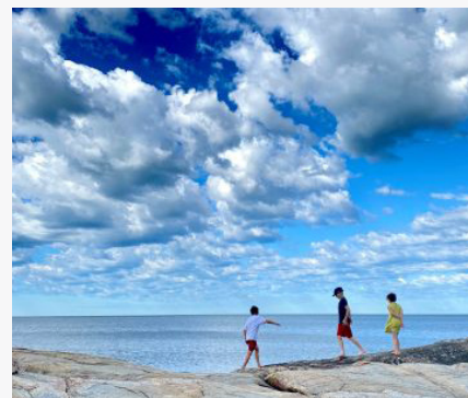
Smartphone Photography: Tips and Tricks with Briget Ganske