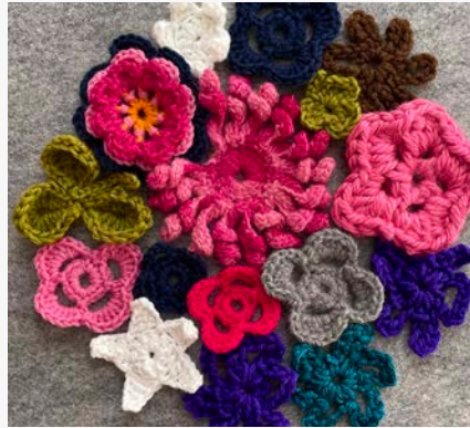
Crochet Flowers Table Topper Workshop with Marsha Borden